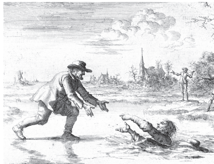
Dirk Willems rescues his captor only to be later martyred for his faith.

The crux of the Gospel of Jesus Christ is to bring change to people's hearts. Without changed hearts, immorality, abortion, murder and a host of other sins